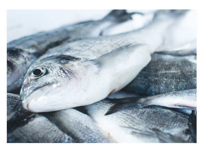
ADVISOR: We believe that as a responsible supplier, one of our key roles is that of an advisor not educator.

Improve the rest: We work hard with our fisheries, NGO's, and Fishing Organisations to seek out the most responsible fisheries for each specific species. We will only sell wild seafood that is traceable back to the vessel that caught it, with evidence that the catch is in quota, and that we believe has been sustainably caught.